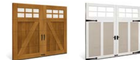
CANYON RIDGE® collection LIMITED EDITION SERIES ULTRA-GRAIN® SERIES MODERN SERIES

Doors with Clopay's Gold Bar Warranty are standard with heavy-duty QuietFlex™, 14 gauge steel hinges and brackets for smooth and long-lasting operation.