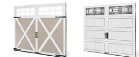
GRAND HARBOR® collection